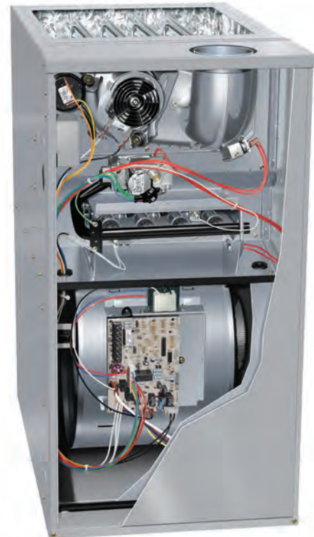
N80 Gas Furnace

KeepRite gas furnaces are designed for durability and comfort. The warmth and efficiency of natural gas combined with a quiet, efficient blower motor delivers comfort throughout the cold seasons. The gas furnace can also be combined with an indoor evaporator coil and properly matched outdoor air conditioner or heat pump to provide cooling during the warm seasons.